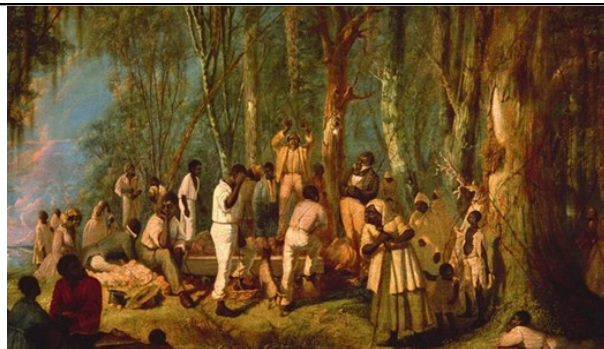
"Plantation Burial"; Antrobus, John (1837-1907)

Scripture has a life of its own. It is the living, breathing Word of God. As we look back at the history of black people in America, we see evidence of how God's Spirit gave birth to the black church in the middle of times of slavery. Early on, with culture, prejudice, and injustice joining forces, few slaves were converted. But Puritan Cotton Mather and other clergymen spoke out strongly for the gospel to be preached to the slaves and for baptism to be offered. With the arrival of Methodists and Baptists, black Christianity began to erupt and spread because these traditions emphasized conversion as a spiritual experience .